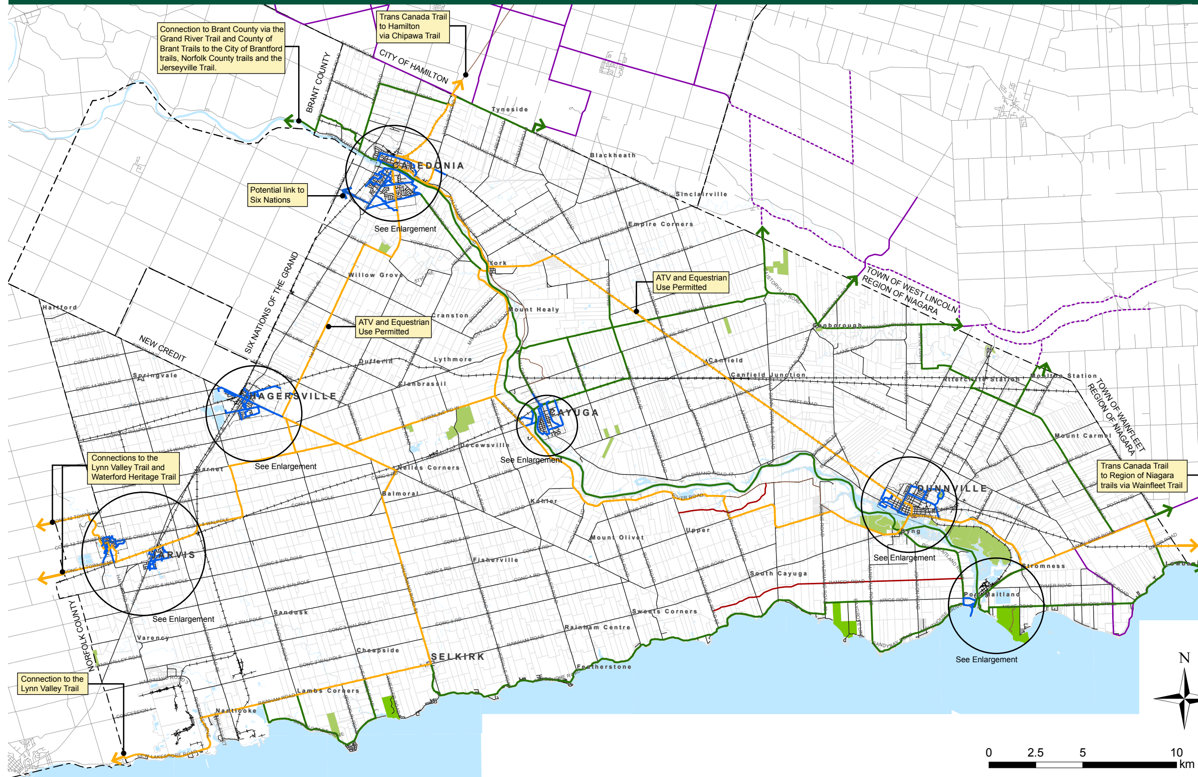
FIGURE 4 - 8 Trail Network Concept