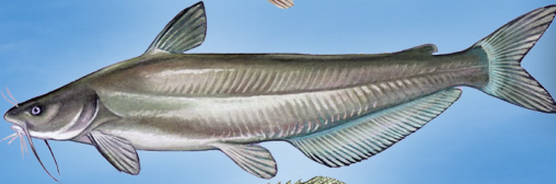
CATFISH (MUDCAT)