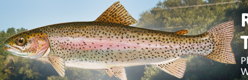
RAINBOW TROUT